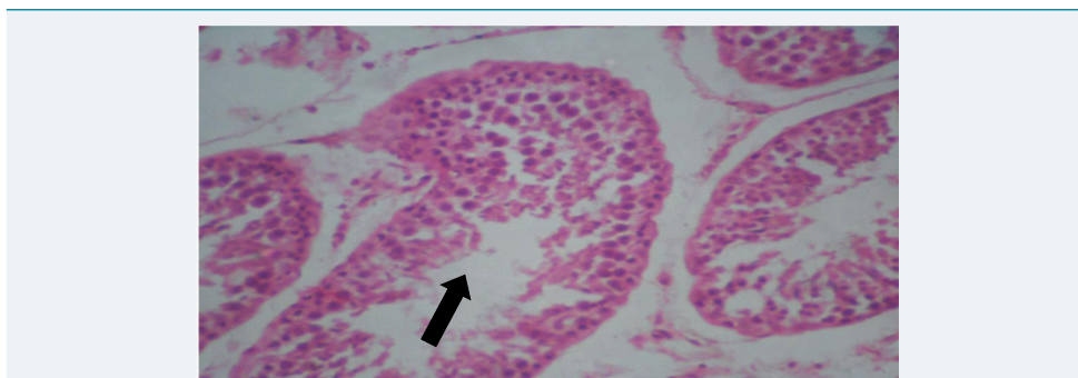
Figure 2: Photomicrograph of testis of treated group: Seminiferous tubules with adequate amount of spermatogenic cells, up to mature spermatids and not many spermatozoa, basically normal (x400) (H&E) stain.

of the treated group compared to the control group. Histologic sections of the seminal vesicles of the control group showed normal epithelium. Similarly, seminal vesicles of the treated group showed normal epithelium. Histologic sections of the prostate glands of the control group showed normal epithelium, in the same manner the histologic sections of the prostate glands of the treated group showed normal epithelium. Histologic sections of the pituitary gland of the control group showed no evidence of lesions in the different pars distalis, intermedia + tuberalis and nervosa. The treated group equally did not show evidence of lesions in the different parts.